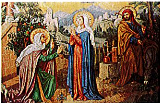
THE MAGNIFICAT (Luke 1:46-55)

My soul proclaims the greatness of the Lord, my spirit rejoices in God my Savior; for He has looked with favor on his lowly servant. From this day all generations will call me blessed; the Almighty has done great things for me, and holy is His Name. He has mercy on those who fear Him in every generation. He has shown the strength of His arm, He has scattered the proud in their conceit. He has cast down the mighty from their thrones and has lifted up the lowly. He has filled the hungry with good things, and the rich He has sent away empty. He has come to the help of his Servant Israel for He has remembered His promise of mercy, the promise He made to our fathers, to Abraham and His children forever.