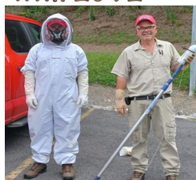
Thank you to Md State Pest Control for taking care of the bee issue at Annunciation Church.